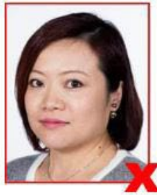
Side on to camera