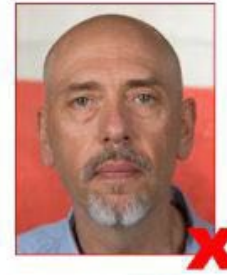
Background not plain