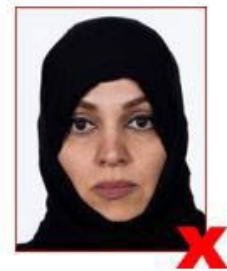
Eyes/edges of face obscured