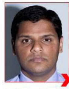
Shadows on image and background