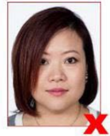
Hair obscuring face