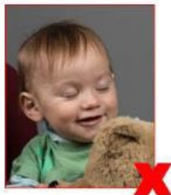
Eyes not open/toy visible