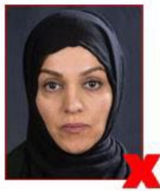
Background too dark